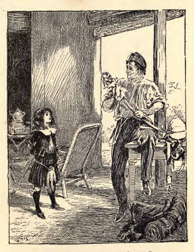
"I POLISHED AWAY AT THE CAPTAIN'S SABRE"